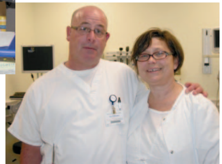
In 2010, MCMH offered clinical training to 141 college and high school students.