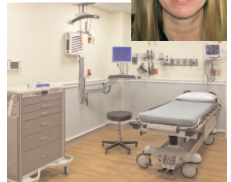
New Emergency Center treatment room